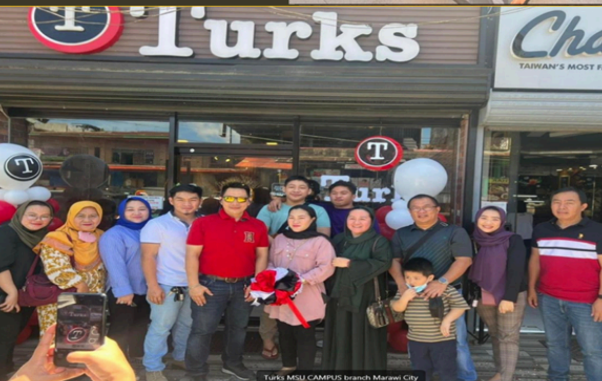
Turks MSU CAMPUS branch Marawi City